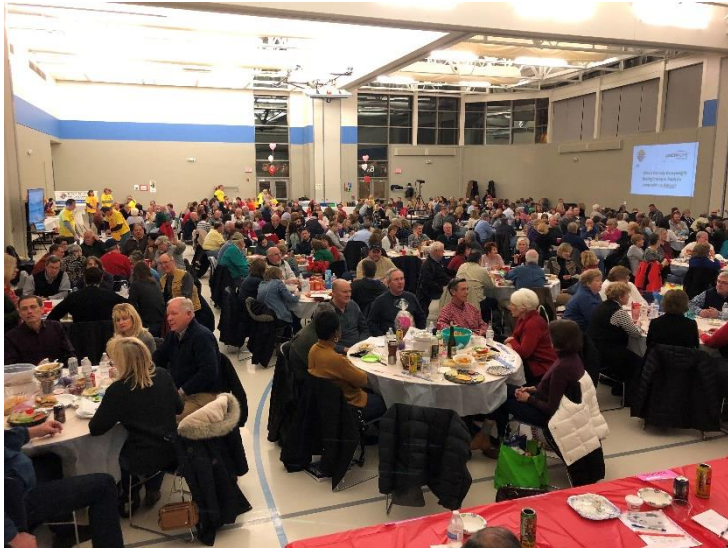
We filled the Parish Center with 44 tables