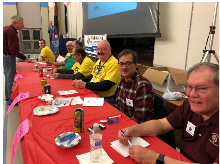
Our judges were top notch!