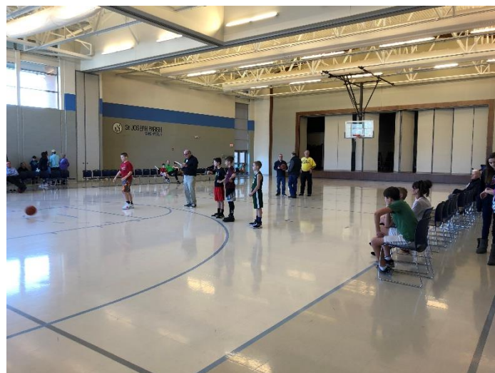
Folks begin to gather as boys begin shooting as Knights help score and organize the groups