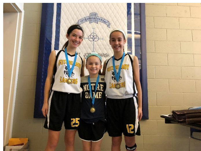
3 sisters won medals and are moving forward to the regionals

On Super Bowl Sunday we sponsored the District Basketball Freethrow Challenge in the Parish Center. Kids came from all around to continue the competition. Winners of the district event will go on to compete in the Regionals and then on to State.